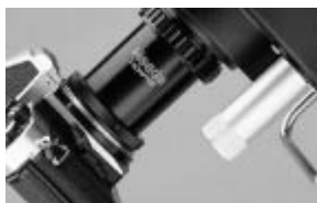
A 35mm Camera Mounted at "Prime Focus"

Typically images would be at low power and provide a wide field of view. This type is great for very wide shots such as of the Milky Way or constellations. This is also the most forgiving method since you can guide at high power through the scope while imaging at low power through the camera. The relatively short exposure times also make it more forgiving of guiding errors. Guiding errors will cause stars to be oblong streaks rather than pinpoints. Exposures of more than a minute or so should be performed on a telescope which is polar mounted (on a wedge or equatorial mount) otherwise field rotation will show up in the images. Field rotation is caused by the photographic field rotating and will cause stars to stretch into circular streaks. In a telescope which is not polar mounted the view very slowly rotates even though the telescope may track accurately and keep the object centered. While this effect is unnoticeable to the visual observer it is a concern for astrophotographers.