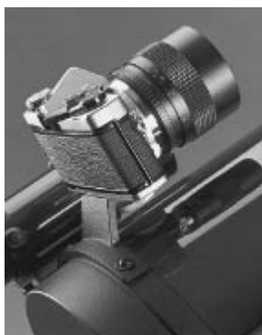
A 35mm Camera "Piggybacked" on a Telescope

Piggyback - A piggyback mount is a simple device which attaches a camera to the telescope tube. This is typically through either a bracket bolted to the rear cell of the scope or a ring which clamps around the telescope tube, both types attach to the tripod mounting hole on the bottom of the camera. The camera is not optically coupled to the telescope, it shoots through its own lens. The magnification obtained would depend solely on the camera lens used. In this method the telescope is used for 2 purposes. It serves as a tracking mount, and additional guiding accuracy can be obtained by using the telescope optics as a guide scope (using a reticle eyepiece to make small corrections of the telescopes drive motors as needed).