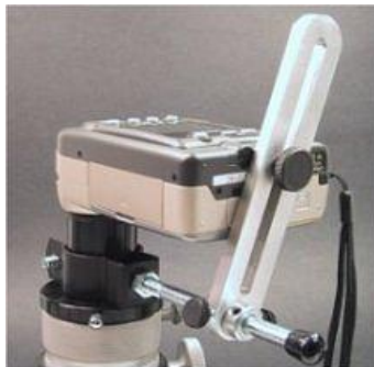
The EZ-Pix™ Digital Camera Holder

The AdaptaView™ is a very universal adapt that will fit many eyepieces with removable rubber eyeguards that have a top diameter of 1.75" or less. Fits many TeleVue and 2" eyepieces. Since it is designed to fit eyepieces that are larger than a T-Thread it does allow some spacing between the camera lens and eyepiece lens. Recommended only for eyepieces with long eye relief and cameras that have smaller lenses to reduce vignetting. This adapter is "T" threaded so you will need the correct components to couple it to your camera. It is compatible with the Digi-T™ system parts. This adapter is suitable for use with Newtonians and Refractors since it does not require extra back focus.