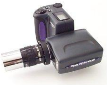
A Digital Camera with Eyepiece Mounted "Afocally"

Afocal Coupling - This method is very rarely used with film cameras but it is the primary method used for digital cameras . In this method both the camera lens and an eyepiece are used. An adapter similar to the eyepiece projection adapter is used but the eyepiece image is optically coupled through the camera lens rather than being projected directly onto the film plane. Since most consumer digital cameras (at least units still reasonably priced at this writing) do not have removable lenses, it can be seen why this method is used for digital cameras. Though you could physically couple a digital camera at prime focus you would simply get a picture of the inside of your telescope and so far that has not become an exciting hobby ; ) Magnification with the afocal method can be very high, in fact higher than we would sometimes like as we will see. However, the speed with which most digital cameras can image reduces the guiding error problem. Most better digital cameras have filter threads on the lens and can be afocally coupled using adapters such as our popular Digi-T™ system. Digital cameras without threaded lenses can be mounted using our EZ-Pix™ digital camera holder. There are a number of other adapters for attaching a digital camera afocally and we will look at them as well.