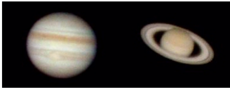
Examples of what can be accomplished with a consumer digital camera.

By Jordan Blessing (Copyright 2001, 2002)