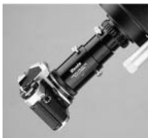
A 35mm Camera Mounted on an "Eyepiece Projection" Adapter